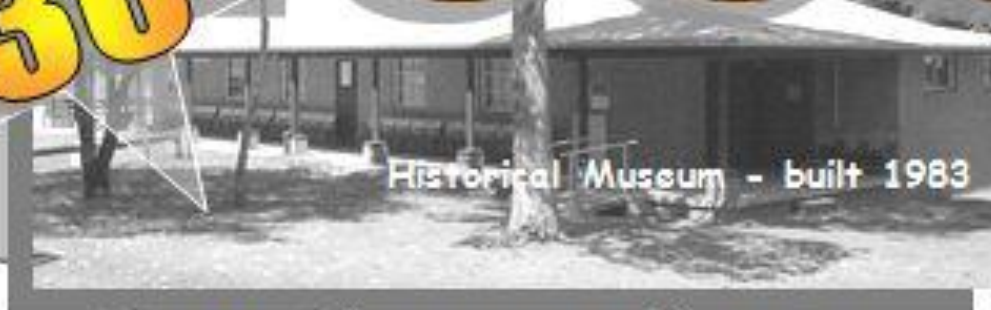
Historical Museum - built 1983

Join us in celebrating the 30 th anniversary of our Historical Museum and other major events of 1983