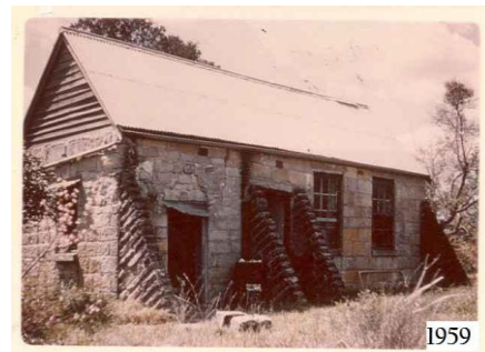
The Cottage looks a little different now!