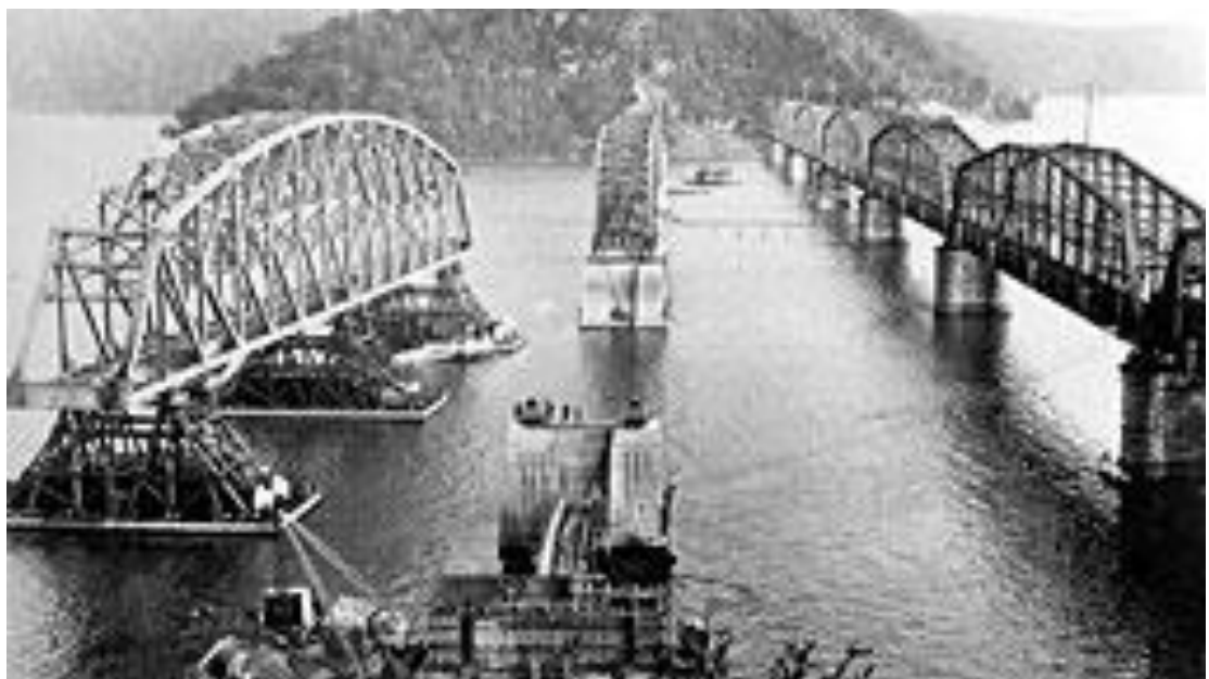
Hawkesbury River Railway Bridges, original and replacement under construction, circa 1945

The First Bridge opened in 1889 and enabled people to travel some 2,880 kms from the top to the bottom of Australia with two breaks of gauge on the Victorian and Queensland borders. The Union Bridge Co. of New York was awarded the contract to construct the bridge in 1885. The bridge had seven spans of 416 ft (127 m) each. 6,320 tons of steel were used for the spans. The piers were concrete below water and sandstone masonry above. Five piers were sunk between 150 and 160ft (46 to 49 m) and pier no. 6 went 162ft below water ; considered an engineering feat.