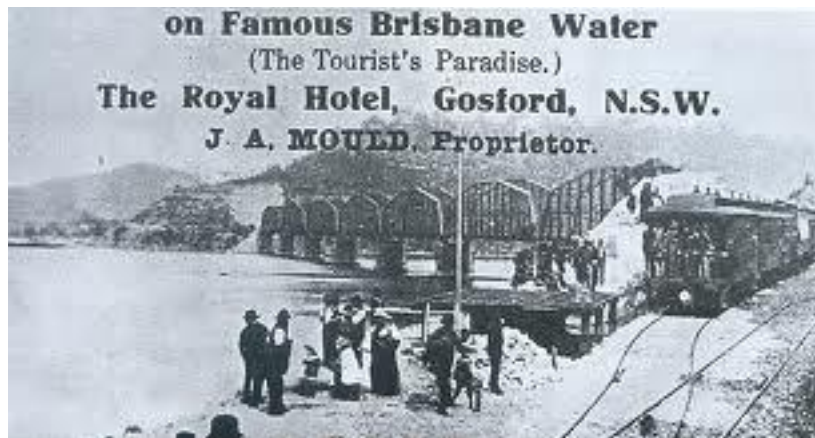
Opening of First Bridge 1889