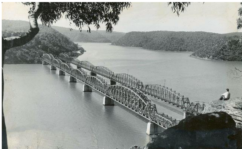
The First and Second Bridges

The Second Bridge opened July 1946 and was also considered a technical achievement at the time of its construction, with its large riveted steel trusses and its footings still being among the deepest in the world. It remains the longest purpose built rail bridge in the NSW network.