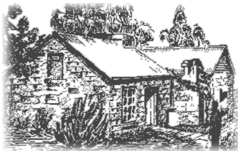
RED COW INN COORANBEAN HENRY KENDALL COTTAGE WEST GOSFORD CIRCA 1836