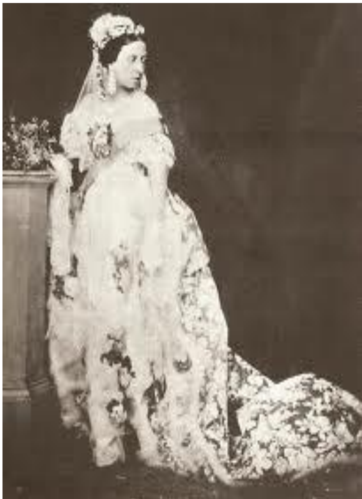
Queen Victoria, 1840: Trendsetter In Wedding White