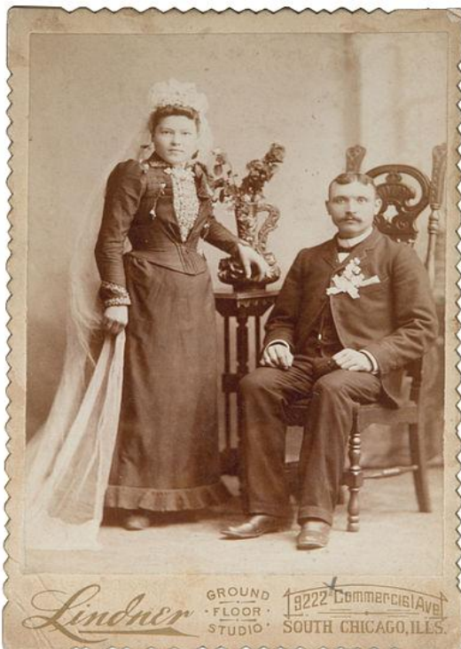
“Best Clothes” wedding