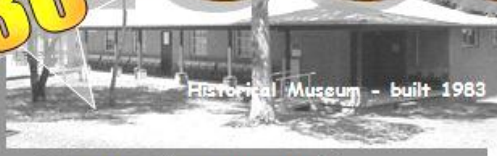
Historical Museum - built 1983

Join us in celebrating the 30 th anniversary of our Historical Museum and other major events of 1983