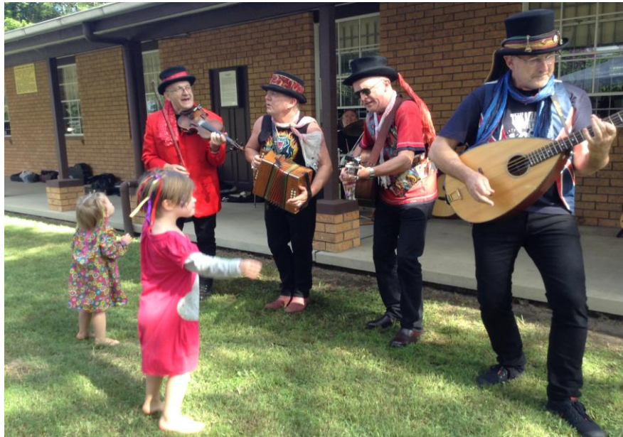
The Wheeze & Suck Band and two Admirers