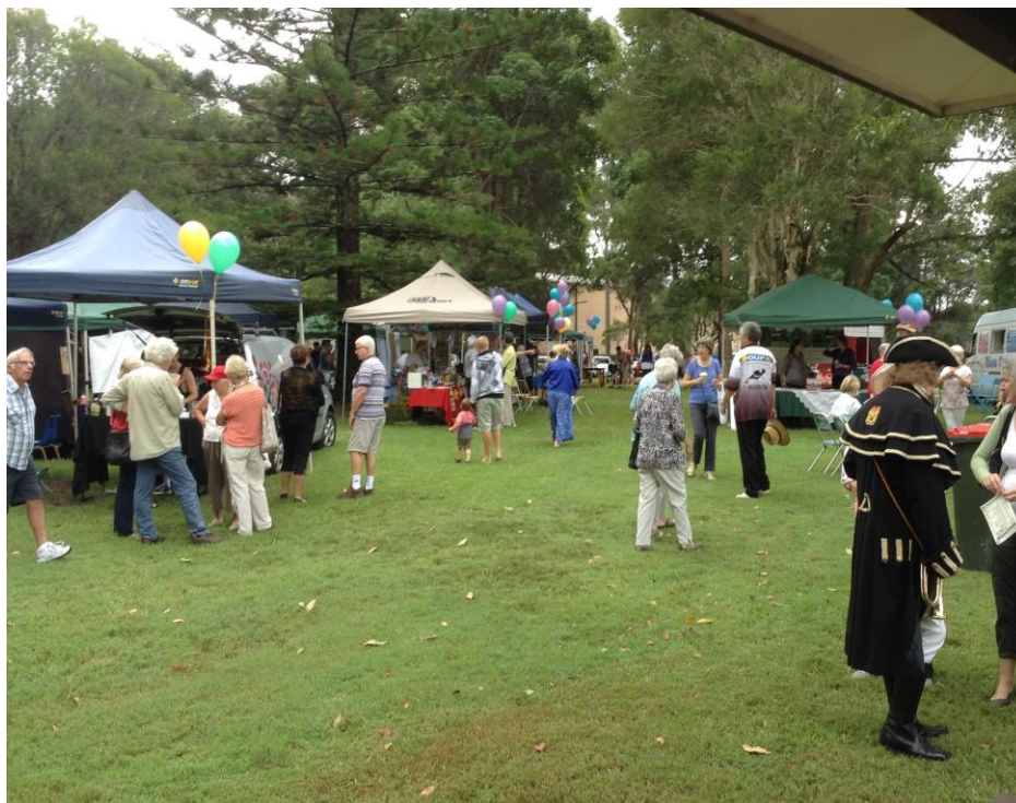
Crowds are starting to arrive