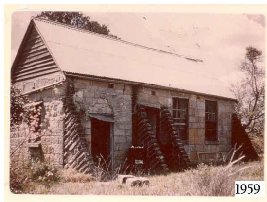
The Cottage looks a little different now