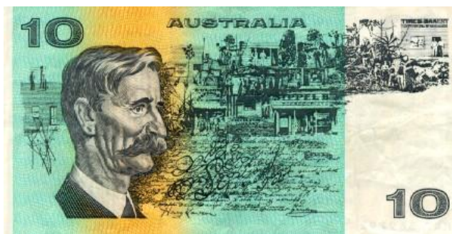
Henry Lawson was on the old $10 note.

Ref: Henry Lawson : an illustrated treasury . – Sydney : Landsdowne, – 1985