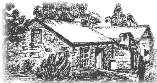
RED COW INN COORANBEAN HENRY KENDALL COTTAGE WEST GOSFORD CIRCA 1836