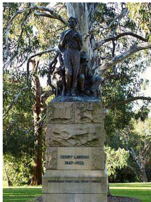
Bronze statue of Henry Lawson and dog. In Domain Sydney. 1931