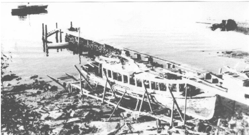
Former Gloria ex Beroona under reconstruction – now Curlew