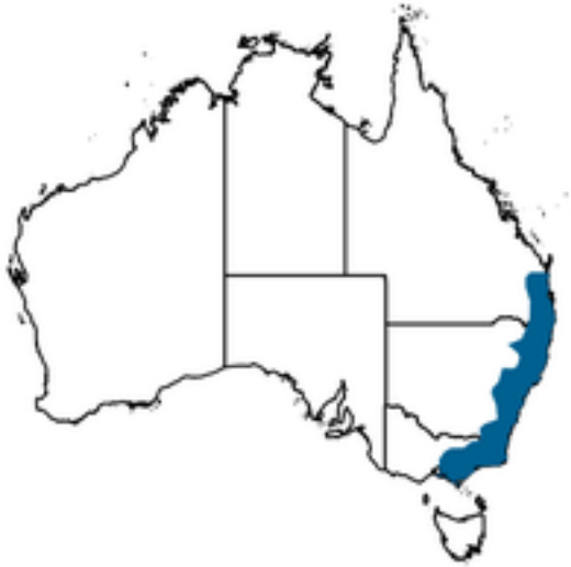
Bell miner range [2]